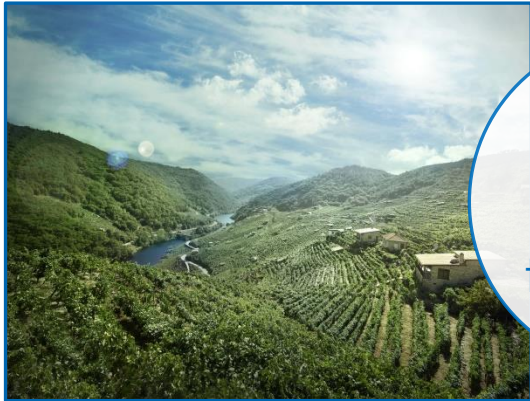
Scenes from Behind the Wheel

Because Galicia is its landscape, we have created a publication with a selection of the 25 best routes through our territory (11 coastal and 14 inland), along with 50 viewpoints and 7 'urban viewpoints' overlooking our major cities. This publication provides 25 suggested routes which cover over 900 km and run through 110 municipalities. Coastal and inland itineraries to discover blue Galicia and green Galicia, a land which is transformed with each new season of the year.