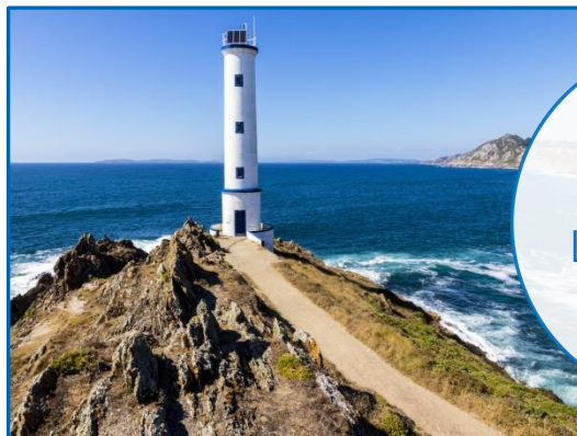
Way of the Lighthouses

This is a new offering from MarGalaica Turismo Marino is designed to surprise visitors with our coastal landscapes, allowing them to immerse themselves in the culture of maritime Galicia and directly engage with its people. From Ribadeo, on the border with Asturias, to A Guarda, on the banks of the Miño with Portugal in full view; the Rías Altas and Rías Baixas regions; great cliffs, vast beaches and tiny coves; cities and seaside towns; fishing ports and fish markets; and of course ... lighthouses.