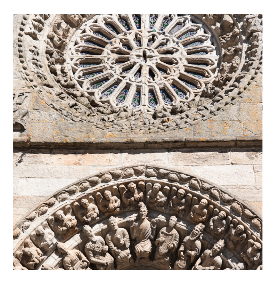
a walk of history and life