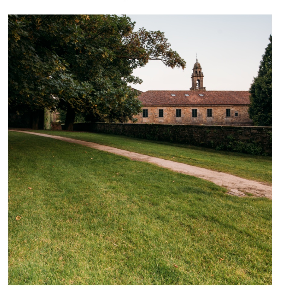
The French Way a walk of history and life